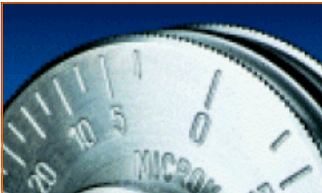
Elcometer 3230 Coil Coating Wet Film Wheels