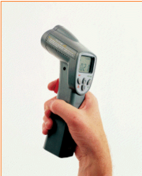
Elcometer 214L Infrared Digital Thermometer (Laser)