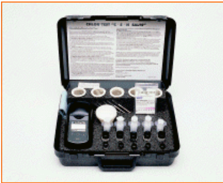
Elcometer 134 CSN Test Kit – Chlorides, Sulphates & Nitrates